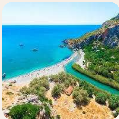
PREVELI PALM FOREST